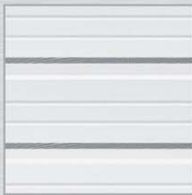
Ribbed Panel Design

Panels are preprimed inside and out to inhibit rust. Hot-dipped, galvanized steel is painted with primer and given a tough oven-baked polyester top coat, to provide the most rust-resistant steel door available. Ten year warranty against rust-through.