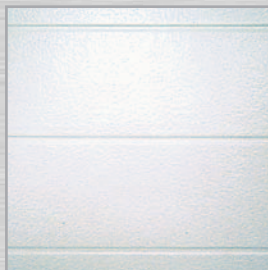
Ribbed Panel Design

Panels are prepainted inside and out to inhibit rust. Hot-dipped, galvanized steel is painted with primer and given a tough oven-baked polyester top coat, to provide the most rust-resistant steel door available. Ten year warranty against rust-through.