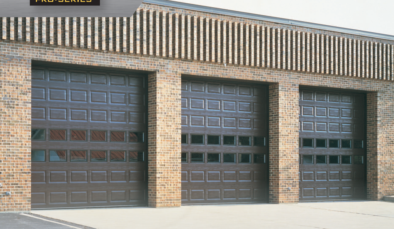
Model 3154 shown