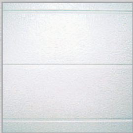
Ribbed Panel Design (Model 3150)

Panels are pre-painted inside and out to inhibit rust. Hot-dipped, galvanized steel is painted with primer and given a tough oven-baked polyester top coat, to provide the most rust-resistant steel available. Ten year warranty against rust-through.